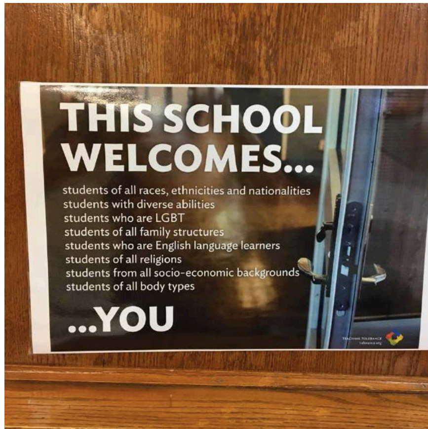
Entrance to Webster Groves High School, St. Louis, MO

Can your school be so welcoming, so inviting, and so comfortable that every person who walks through the doors believes they are about to have an amazing experience?