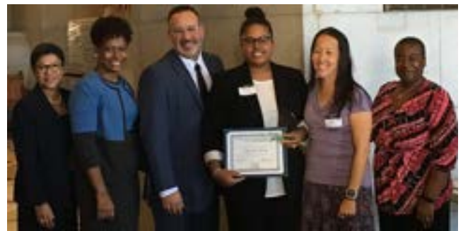
National Parental Involvement Day 2019 - U.S. Secretary of Education, Miguel Cardona, former Connecticut state supt., presents moms with SERC Award for family advocacy.

Each of these audiences has different but important roles and responsibilities related to garnering support for, and implementing, these strategies and actions.